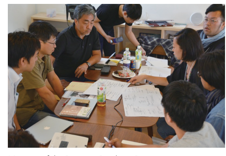
Meeting of the Business Brush-up Program

The song, "Gohan Han Han," that encourages people to consider the significance of eating → http://www.worldfoodday-japan.net/nokomono.php