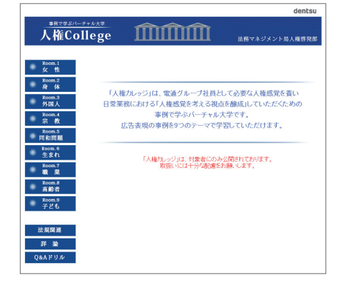
Site screen of the Human Rights College

In fiscal 2015, there were 49 consultations at the Harassment Counseling Section (FY2014: 53 consultations, FY2013: 50 consultations, FY2012: 47 consultations). These were individually handled so that improvements might be made to the working environment.