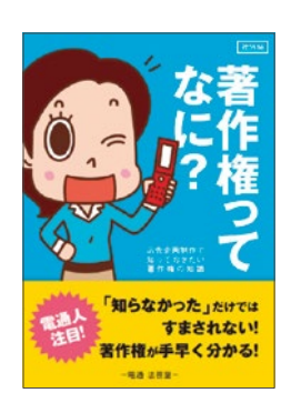
What's a Copyright?