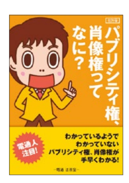
What are Publicity Rights?