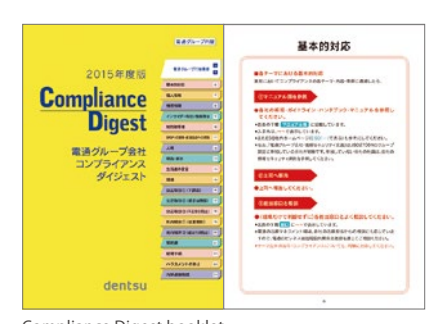
Compliance Digest booklet

^st In fiscal 2012, Dentsu centralized contact points for harassment-related issues at the Harassment Counseling Section. For information on the Harassment Counseling Section, please refer to Page 32.